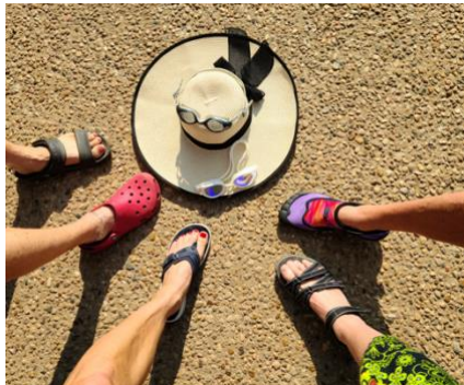
Hike & Bike members enjoyed a morning swim at Barton Springs Pool and lunch on the patio at Las Palomas Restaurant, Sep 2022.