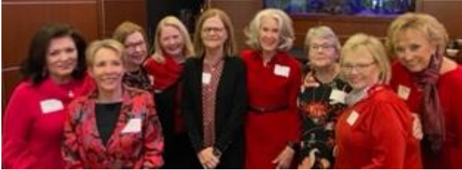
February Galloping Gourmets at Café Blue