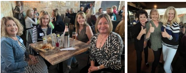
January Girlfriends' Social at the Canyon Grille