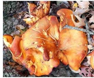
Mushroom on the Hamilton Greenbelt Trail