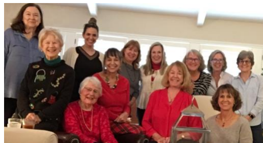
Lakeway Investment Partners Holiday Celebration