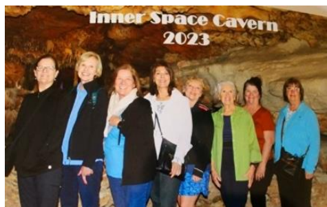
Hike & Bike members on the guided cave tour at Inner Space Cavern in Georgetown, January 2023